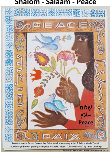
Shalom - Salaam - Peace