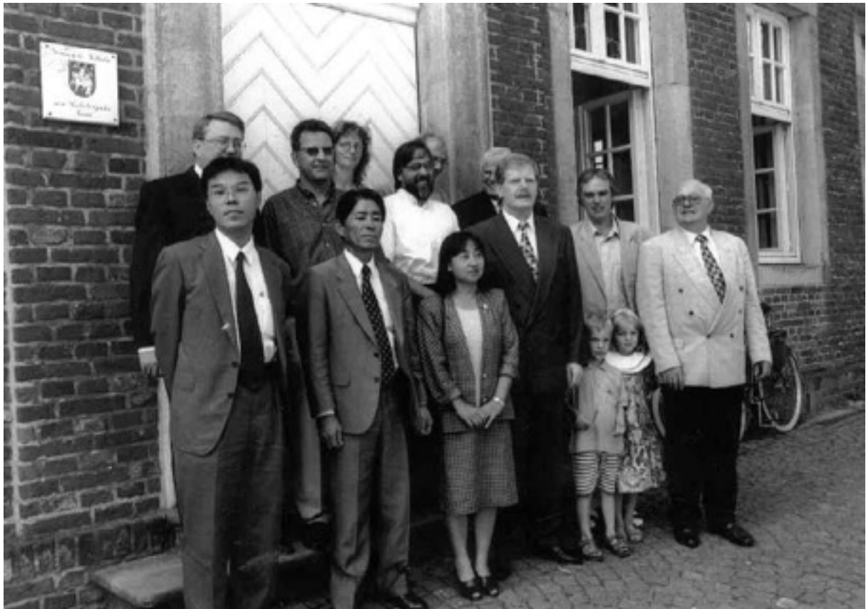
Meeting of the hibakusha delegation with the mayor and members of the Peace Initiative Nottuln

The atomic bombing of Hiroshima and Nagasaki has demonstrated to the world how terrible a nuclear war would be. Only few witnesses can give testimony of that catastrophe.